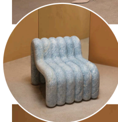
LEFT: The Nudo lounge chair features flowing, parallel curves to create a sculptural, liquid-like silhouette.