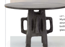
LEFT AND BELOW: The Primal Mystery collection's Scarf dining table and Scarf console both feature a mix of plaster glass and marble.