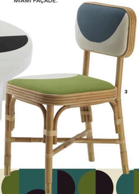
1. CAP MARTIN SOFA. 2. ECLIPSE LOW TABLE. 3. CAP MARTIN DINING CHAIR. 4. THE PATTERN THAT WRAPS RALPH PUCCI'S MIAMI FAÇADE.