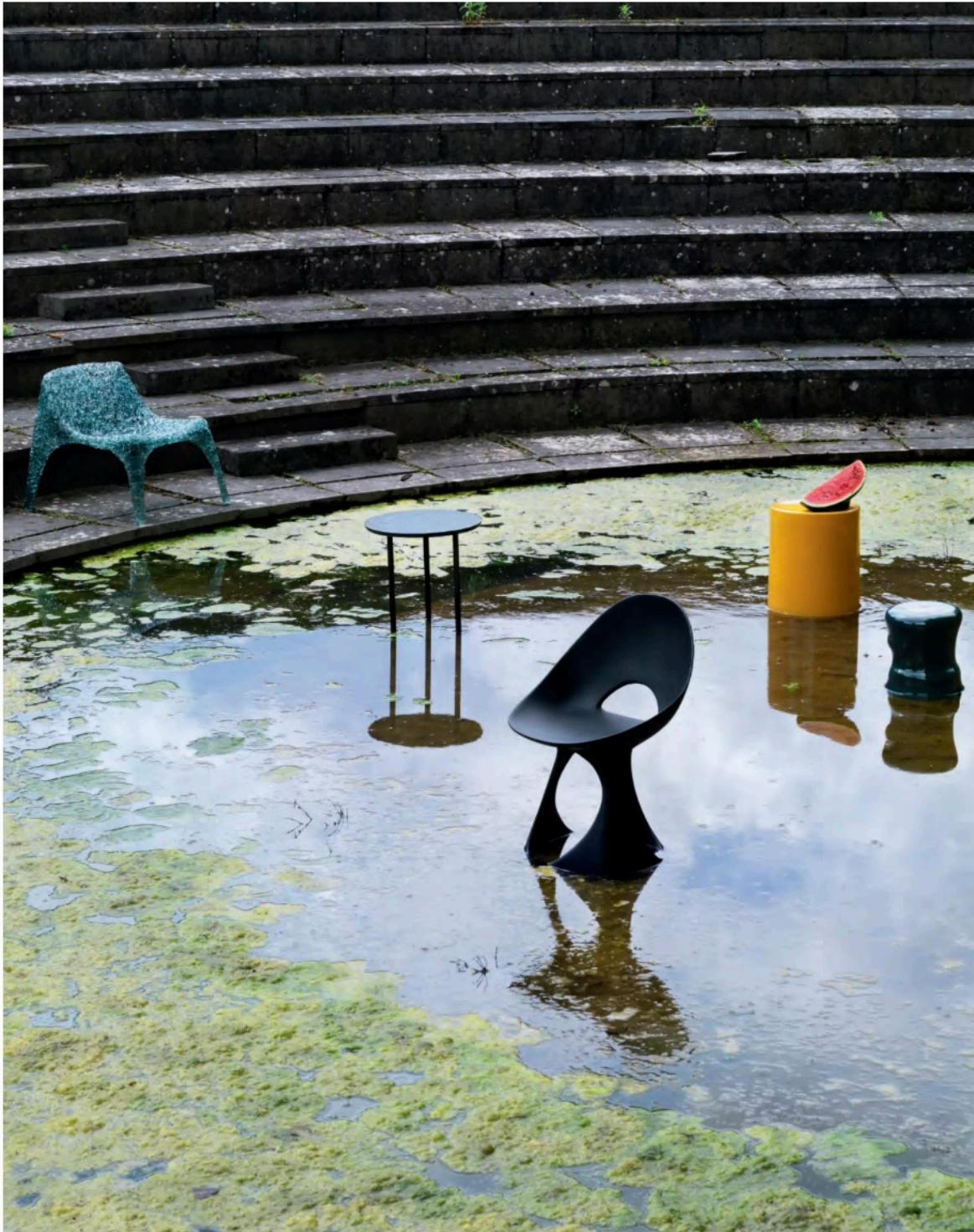
From left: 'Veronica' chair, by Jacopo Foggini, from £4,176 approx, Edra. 'Regent' coffee table, by Vincent van Duysen, £1,438, Molteni & C. 'Libre' chair, by Paul Mathieu, £3,650, Ralph Pucci. 'Pawn' side table, £360; 'Pawn' stool, £174; both SCP