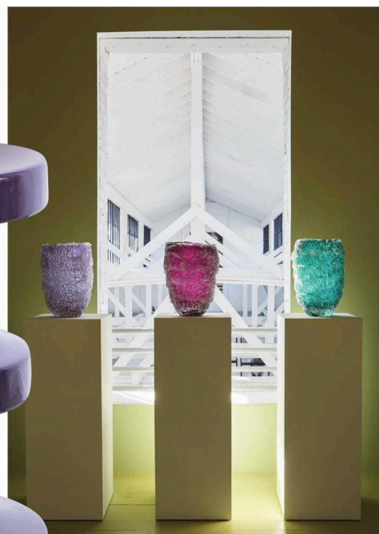
STOOL: COURTESY OF RALPH PUCCI